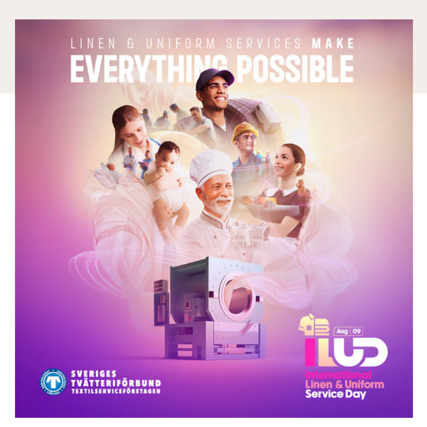
Marketing material for International Laundry and Textile Service Day 2021 made by Infinite Laundry.

Save the date August 9 in your calendar today and please join us as our partner in celebrating the day.